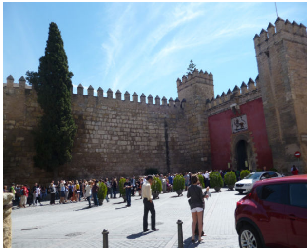
Alcazar in Seville

It is hard to believe how these gorgeous buildings were constructed, truly remarkable.